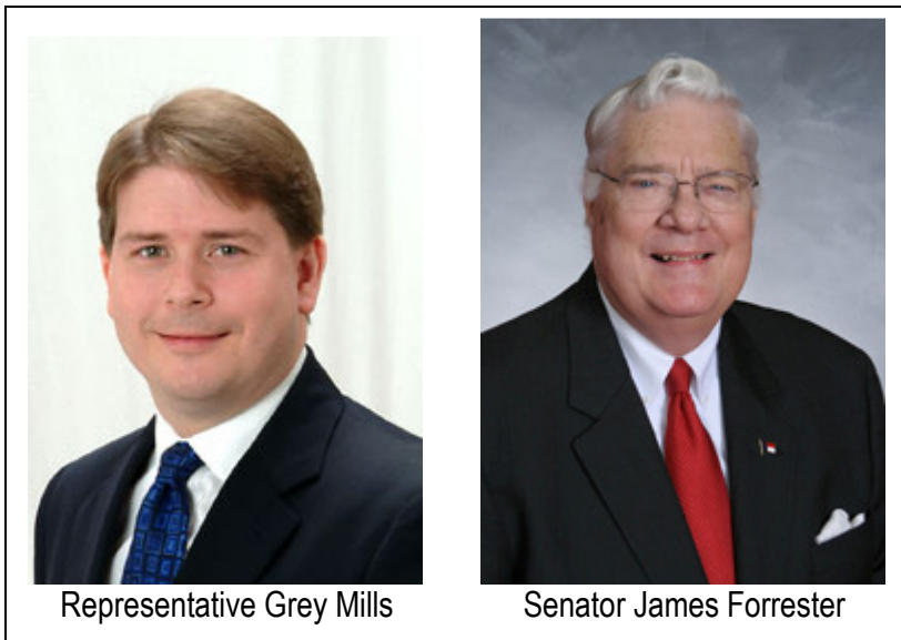
Representative Grey Mills